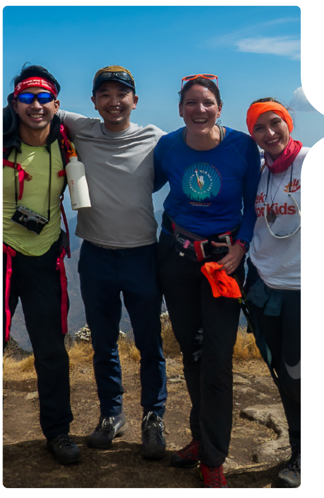
GSK employees participating in the Trek for Kids fundraiser