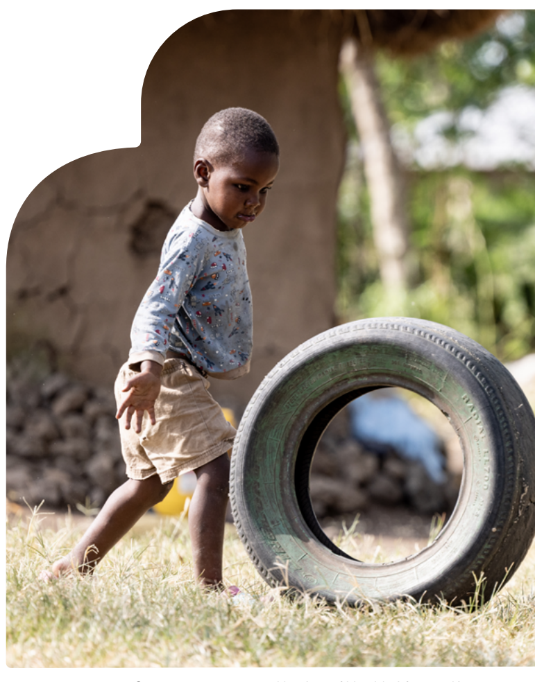
Community supported by Amref Health Africa in Kenya

The Global Health Impact Partnership's team operates within GSK's Governance Framework, to ensure oversight and that we deliver our programmes and activities in line with our Global Health Strategy. We can only deliver on our bold ambitions for patients and communities if we maintain a well-embedded risk management and internal control framework, that is overseen by the leadership team.