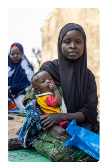
Mothers wait for the mobile vaccination team to arrive in a remote community in Jigawa State, Nigeria

807,200+ cases of malaria, pneumonia or diarrhoea in children treated