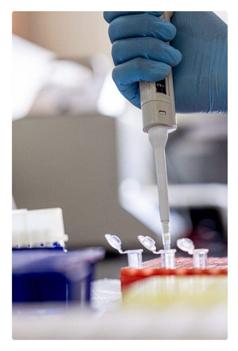
Makerere Lung Institute, Kampala Uganda

A further call for proposals was launched in November 2023.