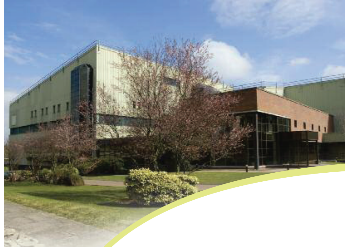
GSK Barnard Castle Site Contacts