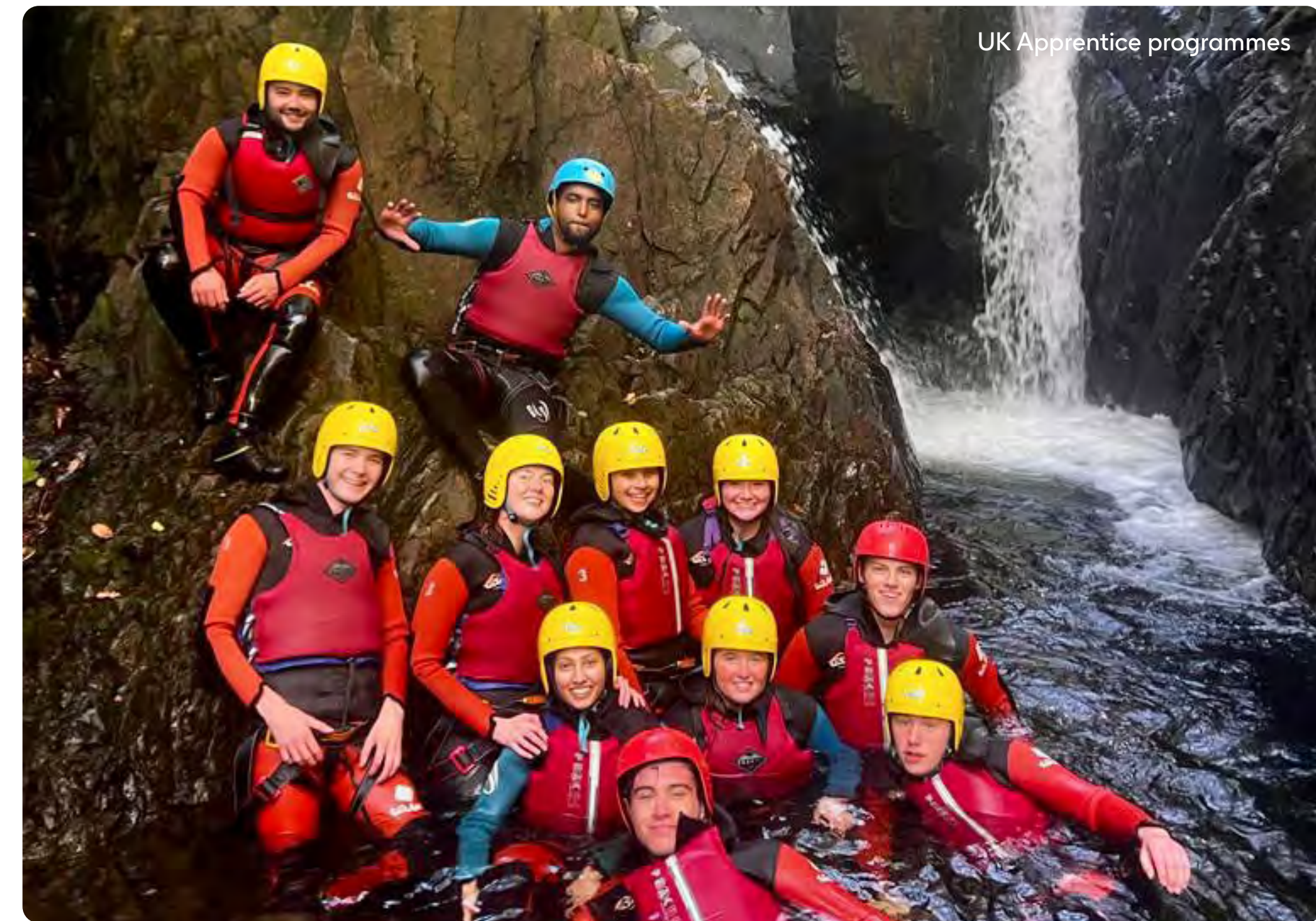
UK Apprentice programmes